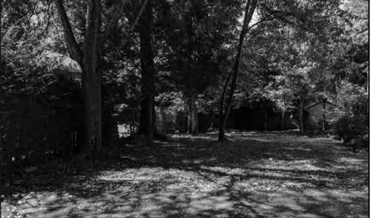
157 POWELL STREET