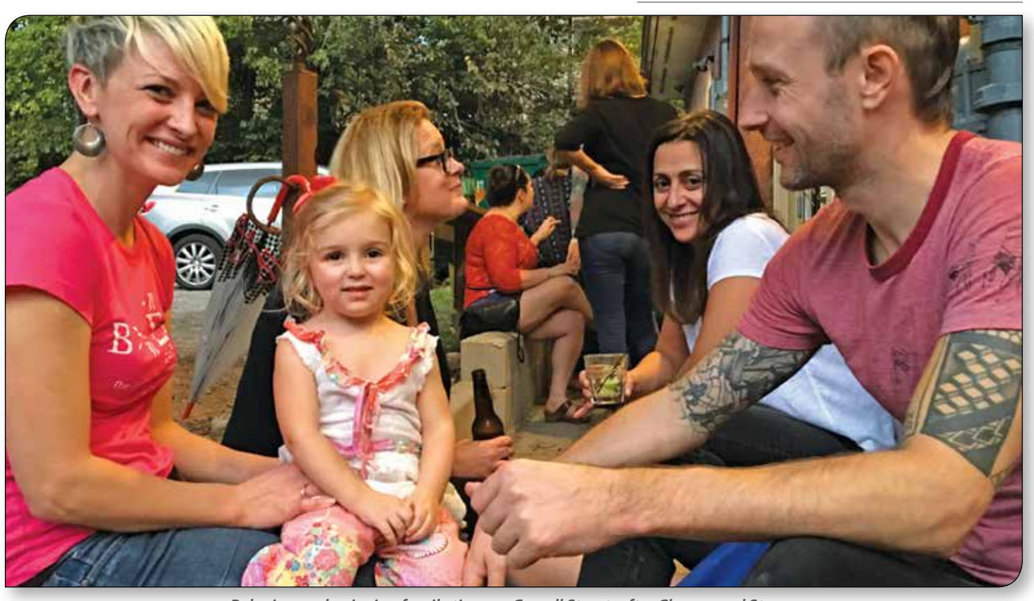
Relaxing and enjoying family time on Carroll Street, after Chomp and Stomp