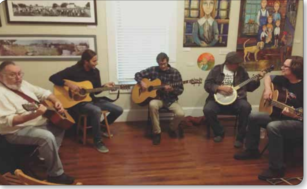
The Carroll Street Troubadours at The Patch Works Art & History Center.

Most museums hang a few things on the wall and call it a day. But not our very own Patch Works Art & History Center, located at the corner of Gaskill and Carroll Street.