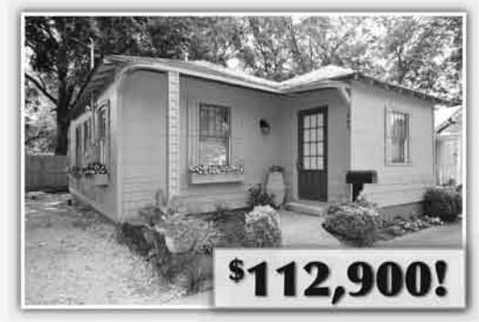
1085 Sanders St. - Ormewood Park 2 BR/1 BA