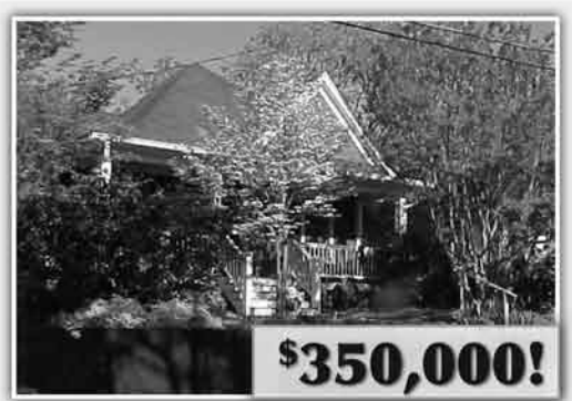
209 Powell St. - Cabbagetown 3 BR/2 BA