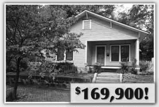
541 Waldo St. - Grant Park 2 BR/1 BA