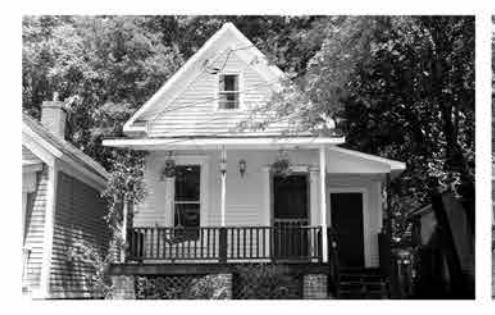
154 SAVANNAH STREET