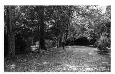
157 POWELL STREET