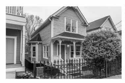
220 BEREAN AVENUE