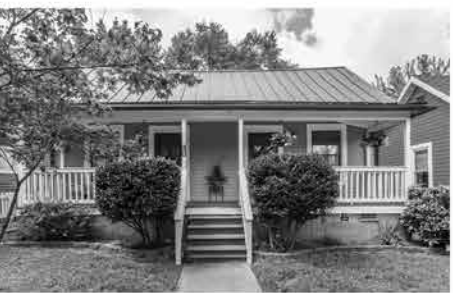
255 ISWALD STREET