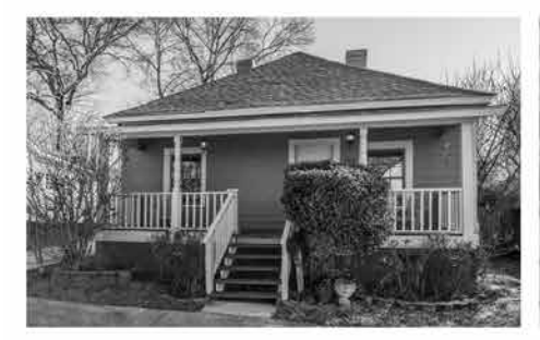
192 SAVANNAH STREET