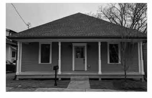
171 SAVANNAH STREET