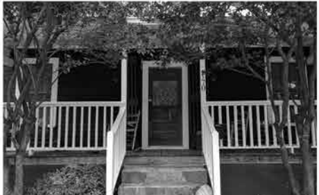
170 SAVANNAH STREET