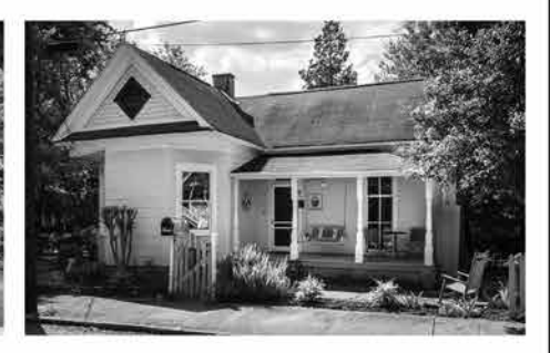
153 POWELL STREET