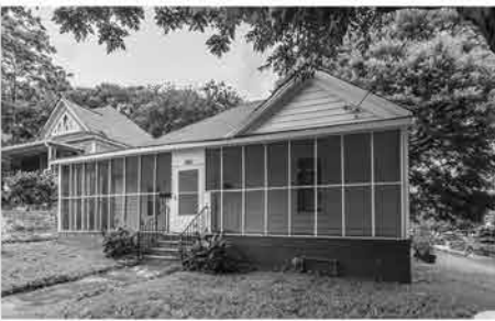
686 KIRKWOOD AVENUE