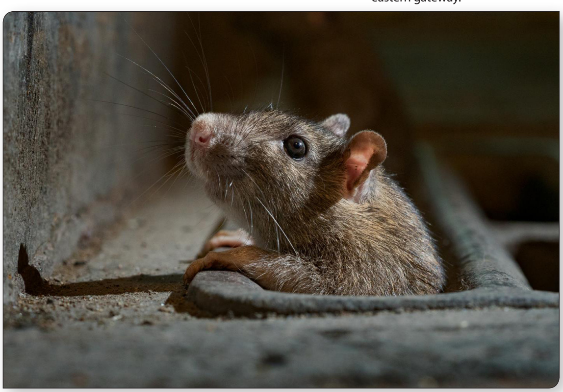
Admit it... you think she's kinda cute, right?

For Oakland Cemetery, we hope they get their long-awaited eastern gateway.