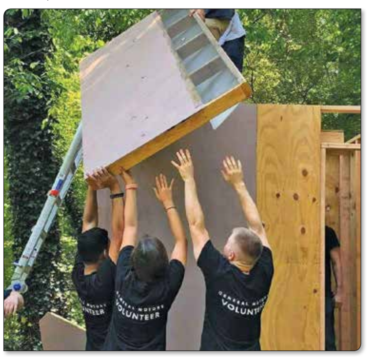
The Mad Housers volunteers building a home for a homeless person.

Additionally, there will be raffles for gift certificates from amazing local businesses that have stepped in to help like Agave, The Brickstore Pub, Little Tart Bakeshop, and others. Mad Housers board members will be on hand to answer any questions you might have about us and discuss any volunteering opportunities that may be of interest.