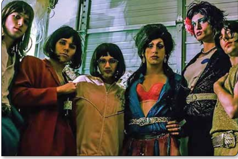
Material Girls' Leather comes out July 2nd.

"Residual Grimace" opens the album with a guitar riff that