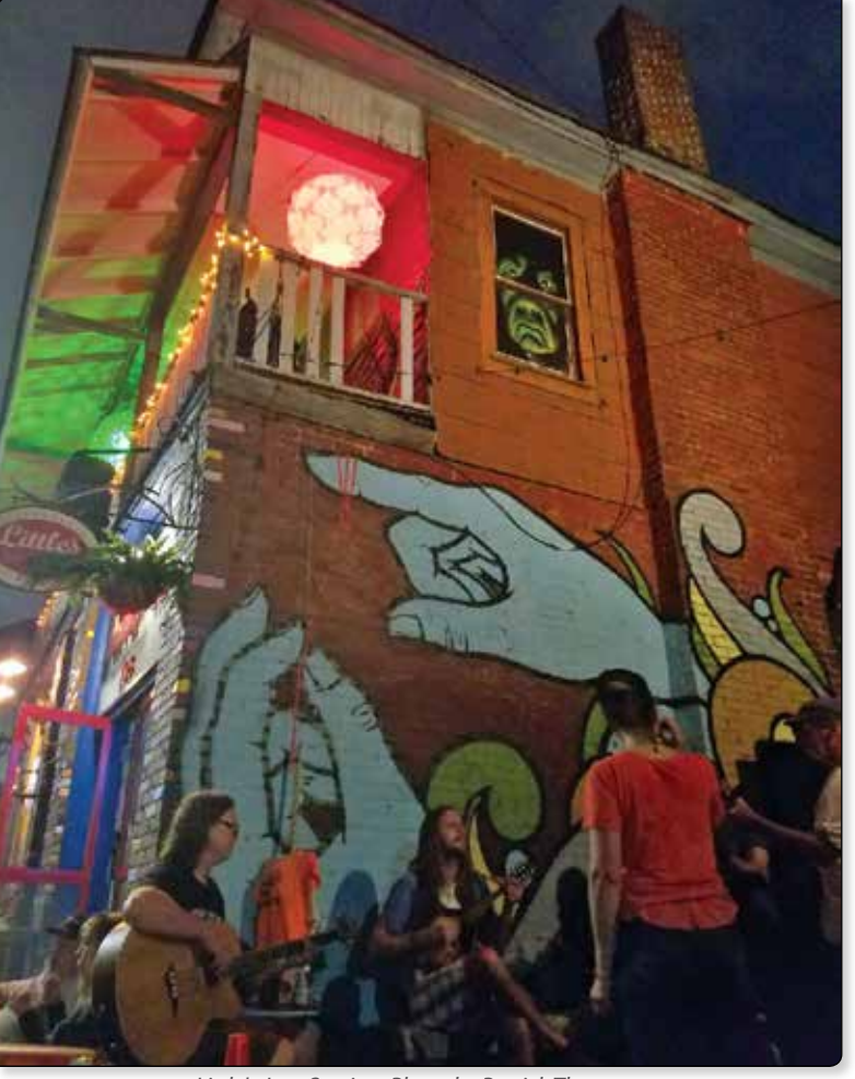
Little's Jam Session.

Please Support Your Cabbagetown Museum Visit: gf.me/u/gk6hag