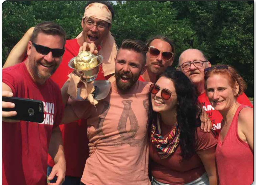
The Mighty Estoria Street Spankers and the Golden Cabbage Trophy.

And so the sun has set on the Inaugural Cabbagetown Olympics. Heroes from across the neighborhood took to the field and competed in Cabbagetown history (even if some details get slightly embellished). As far as we're concerned, everyone was a winner, and we thank