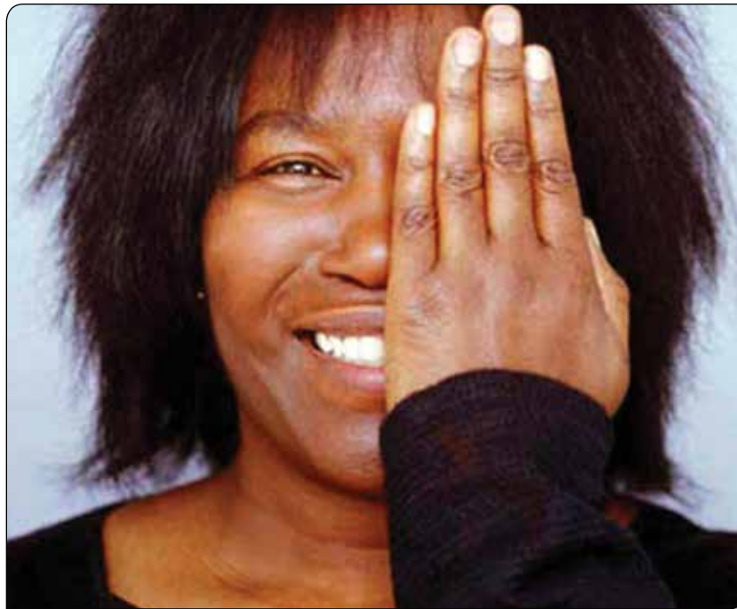
Joan Armatrading. A three night stand at City Winery.

June 21 st Ray Wylie Hubbard @ City Winery – Some Texas singer-songwriters tend to live hard and not last a long time (except maybe Willie Nelson), but Hubbard's voice and wit are still as sharp as a razor. His dark and hilarious story-songs are unforgettable, and his sense of humor is sometimes out of the park. A must-see if you have never had the experience.