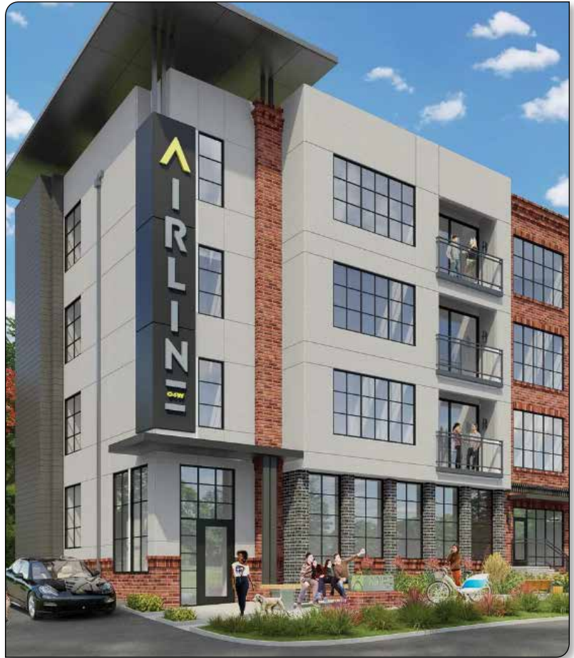
Airline Condos at 22 Airline Street. Coming: Summer 2019

Airline's construction could kick off within the next few weeks, and the homes are slated for a summer 2019 delivery.