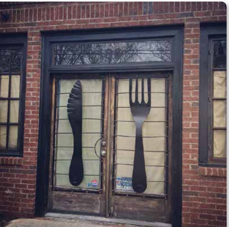
We adore this door. The future front door of Mouth of the South.

Mouth of the South will be open for lunch and dinner. 186 Carroll Street SE, Atlanta. illegalfoodatlanta.com.