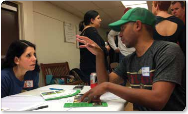
Discussing possibilities for The Patchworks Art & History Center

Cabbageheads learned a ton! CNIA, CI, and The Patchworks shared a ton of info this past February 3rd. We hope y'all will consider volunteering for a variety of great posts within our little 'hood.