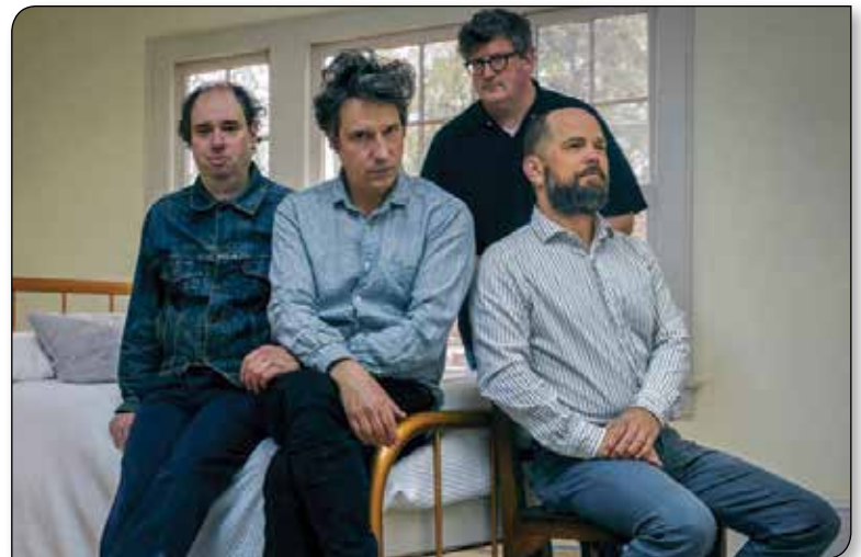
The Rock*A*Teens' Sixth House comes out June 29 th .