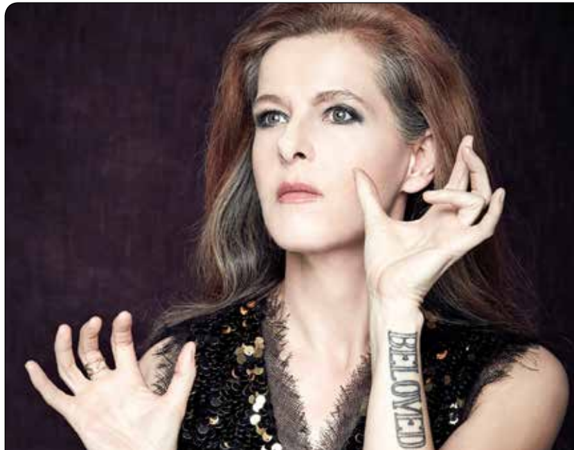
NekoCase.

May 17 th – Margo Price at Variety Playhouse. While mainstream country music (Yep, here I go again) is currently populated by female artists that are way more pop than country, and way more groomed than talented, Price is a breath of fresh hillbilly air. Her direct approach is what makes country music so real – three chords and the truth, no matter how difficult that truth may be to hear. Any woman that can put a "Hurtin' (On The Bottle)" like she can fits right in with the REAL outlaws.