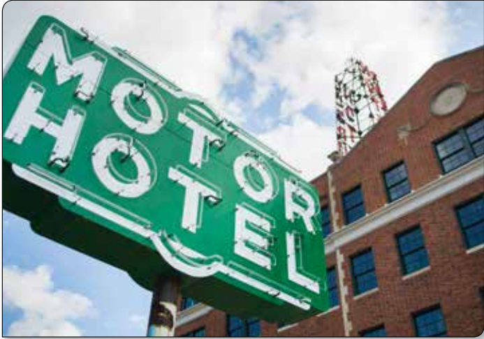
This sign could be yours... if the price is right.

Own a piece of the old Hotel Clermont. One of the hotel's supposed signs was for sale for $400 on Craigslist . Now on eBay , the ante has been upped to nearly $3,000. And, it's likely to keep going up. However, it seems the "Clermont Hotel" sign listed