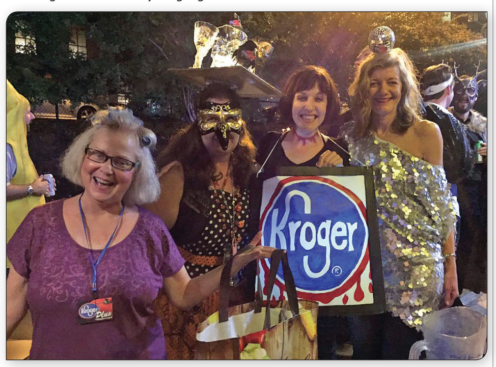
Disco? Murder? Krobar? Cabbagetown loves it's Kroger's.

Why would Kroger do this? Brand loyalty. The more you spend at Kroger, the more money your organization gets, but also the more money Kroger gets.