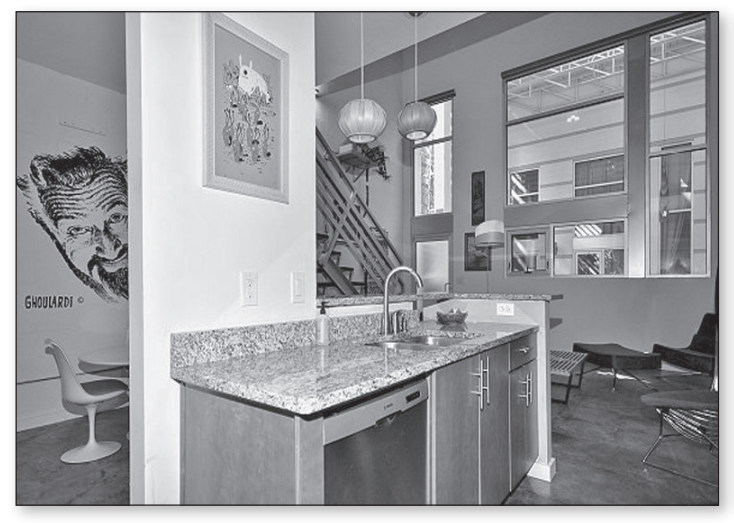
2 Bedrooms • 2 Bathrooms

True loft living in the heart of Cabbagetown. This 2 bedroom, 2 bath, 2-story unit has it all!