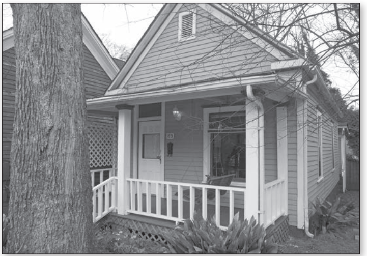
I Bedroom • I Bathroom

Please visit CabbagetownChronicals.com for details!