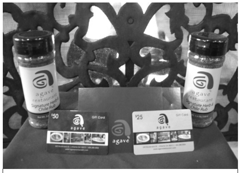
Agave gift cards and our signature chile & herb rub make great gifts! To purchase, stop by Agave or order some online at www.agaverestaurant.com

Thanks to everyone who turned out for our Neighborhood Appreciation Party last month! It was wonderful to serve you all and we hope to see you all back very soon!