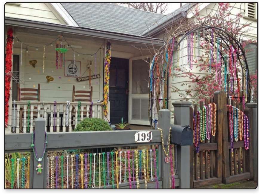
Happy Mardi Gras, ya'll!

When you're taking your next stroll through the neighborhood, come on by the curve on Estoria Street and enjoy the thriving Cabbagetown spirit of New Orleans.