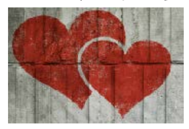
Celebrate Valentine's Day.. all weekend at Agave!

We will be celebrating the big day this year all weekend and offering some great dinner and drink specials in addition to our regular menu. February 14<sup>th</sup>, 15<sup>th</sup> & 16<sup>th</sup>