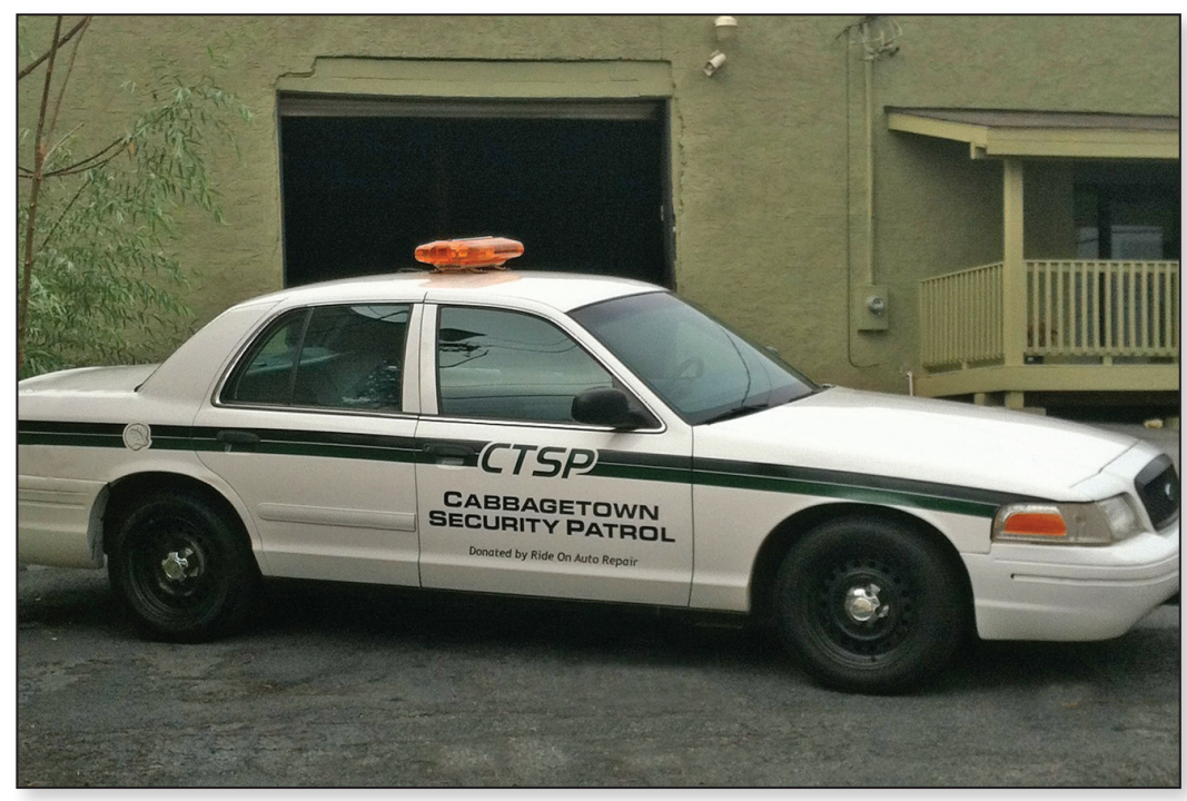
Your Cabbagetown donation dollars hard at work. Special thanks to "Ride On Auto Repair".

The Community Center is located at 177 Estoria Street. If you have an item to add to the agenda, please email cniaboard@gmail.com.