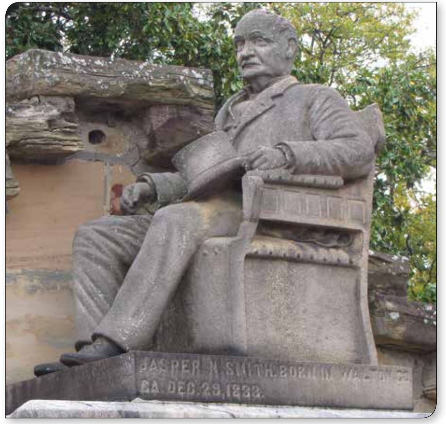
Jasper Smith Statue at Oakland Cemetery.

One, known as "the house that Jack built", was cobbled together