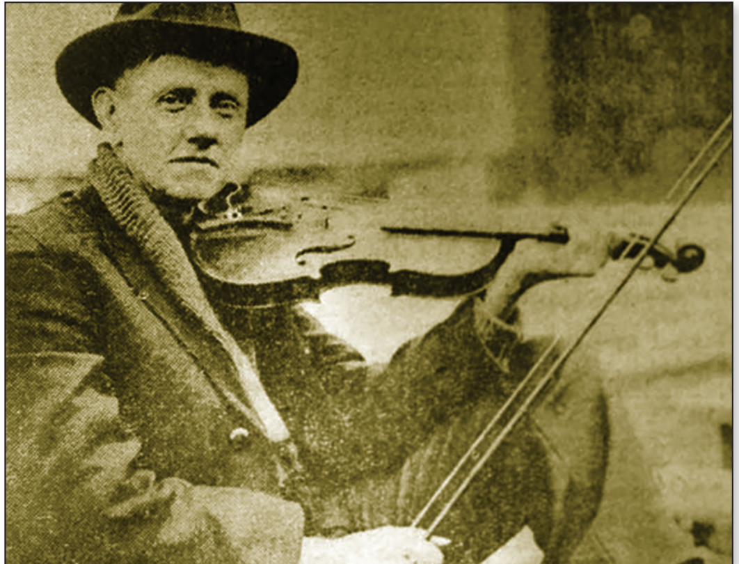
Cabbagetown resident, Fiddlin' John Carson. Circa 1922

The Community Center is located at 177 Estoria Street. If you have an item to add to the agenda, please email cniaboard@gmail.com .