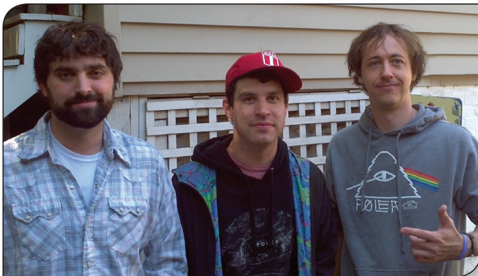
Pictured above, from left to right: Brian (Geologist), David (Avey Tare), and Josh (Deacon) of Animal Collective. Not pictured; Noah (Panda Bear).

Last month, Animal Collective was stealthfully among us while working on new material for an upcoming release.