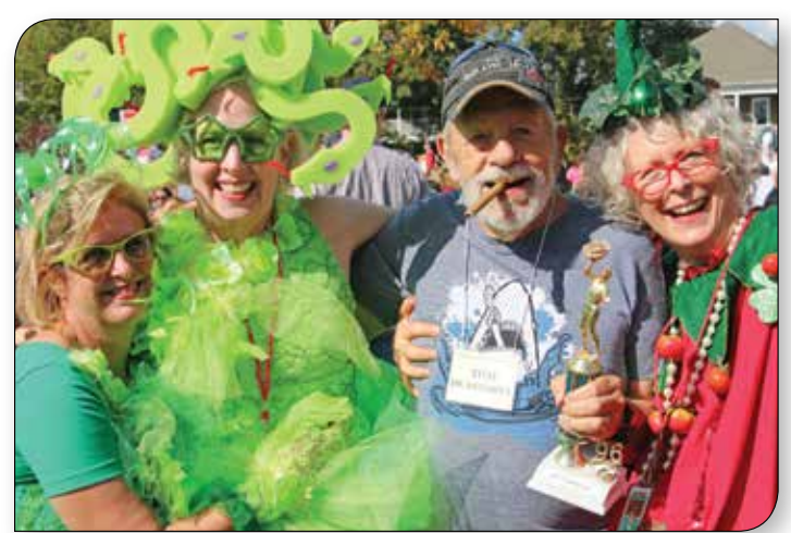
Chomp and Stomp volunteers know how to have a good time.

Unfortunately things changed with the closing of the mill in 1978. Our little milltown began to show signs of poverty and crime in the late the 70s early 80s. But you can't keep a good 'hood down. There was an abundance of housing with affordable rent which attracted both artist and musician alike. They appreciated Cabbagetown for its cheap rent, quiet streets, and simple shot gun homes.